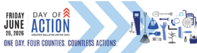
LINKEDIN PROFILE BANNER