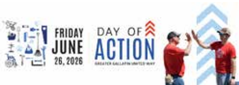
TWITTER PROFILE BANNER