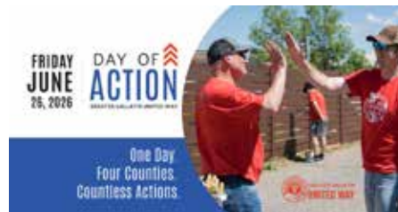
FACEBOOK EVENT BANNER